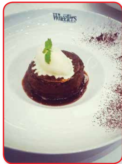
WORDS: SELINA JULIEN